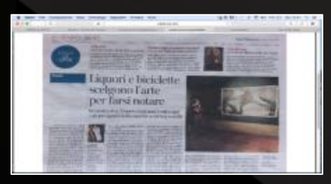
Corriere della Sera