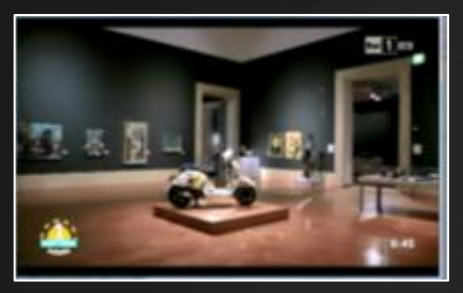
Rai 1 – Uno Mattina