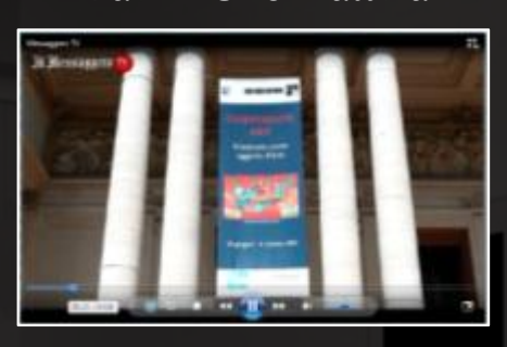
Il Messaggero TV