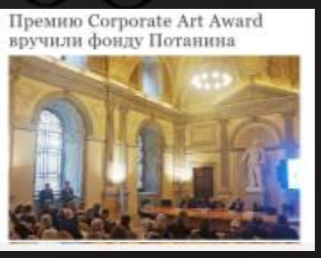
The Art Newspaper